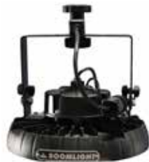
CUSTOM 150W RHB