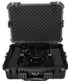
LIGHT CASE (optional)