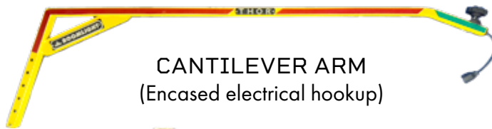
CANTILEVER ARM (Encased electrical hookup)