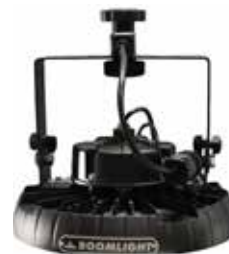
CUSTOM 150W RHB