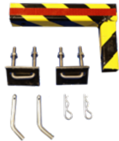
ANGLE ADAPTER Hook up off the side