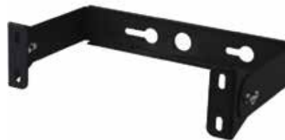
PIVOTING YOKE MOUNT