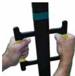
VERTICAL MOUNT WITH PIVOT GRIP