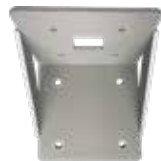
ANGLE MOUNT (Primed for paint)