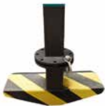
360° INGRESS EGRESS HITCH