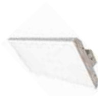
165 W FLAT PANEL (optional)