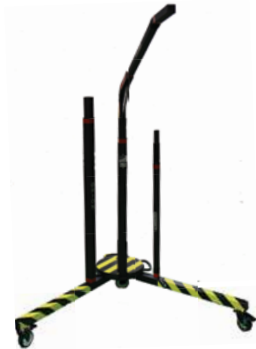
STORAGE FOR INCLUDED TUBES & CANTILEVER ARM